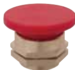
Part No. Description PC-4M-(color) . . . 7/8-32 Thd., Mushroom (specify color)