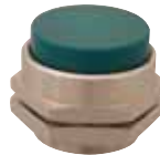
Part No. Description PC-4E-(color) . . . 7/8-32 Thd., Extended (specify color)