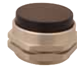
Part No. Description PC-5E-(color) . . 1 3/16-28 Thd., Extended (specify color)