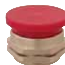
Part No. Description PC-5M-(color) . . 1 3/16-28 Thd., Mushroom (specify color)