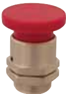
Part No. Description PC-3M-(color) . . . 5/8-32 Thd., Mushroom (specify color)